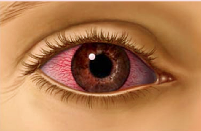
Inflamed or irritated conjunctiva

Conjunctivitis , or Pink Eye , as it is commonly called, is swelling and irritation in the eye. It affects the tissue that covers the eye and lines the inner surface of the eyelid. This tissue is called conjunctiva.