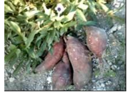
'Solomon' 'Three Months' Plate 2. Sweet potato varieties. Note 'Solomon' variety at bottom left, showing damage resulting from root knot nematode.

The proximate analyses of the nutrient compositions of the six sweet potato varieties are presented in Table 8. The results of this study indicate differences among the six sweet potato varieties in their nutrient contents. The varieties showed significant difference in values of moisture contents. Moisture content ranged from 65.9% in 'Three Months' to 69.9% in 'CI001'. The mean values of sodium (Na<sup>+</sup>), on a dry weight basis, ranged from a low 131 mg/100g for 'Three Month' to a high of 389 mg/100g for 'Solomon'. The values for potassium (K<sup>+</sup>) ranged from 381 mg/100g for 'Solomon' to 1106 mg/100g for 'CI001'. The ash content varied from a low 0.82% for 'Six Weeks' to a high 1.45% content for 'Solomon'.