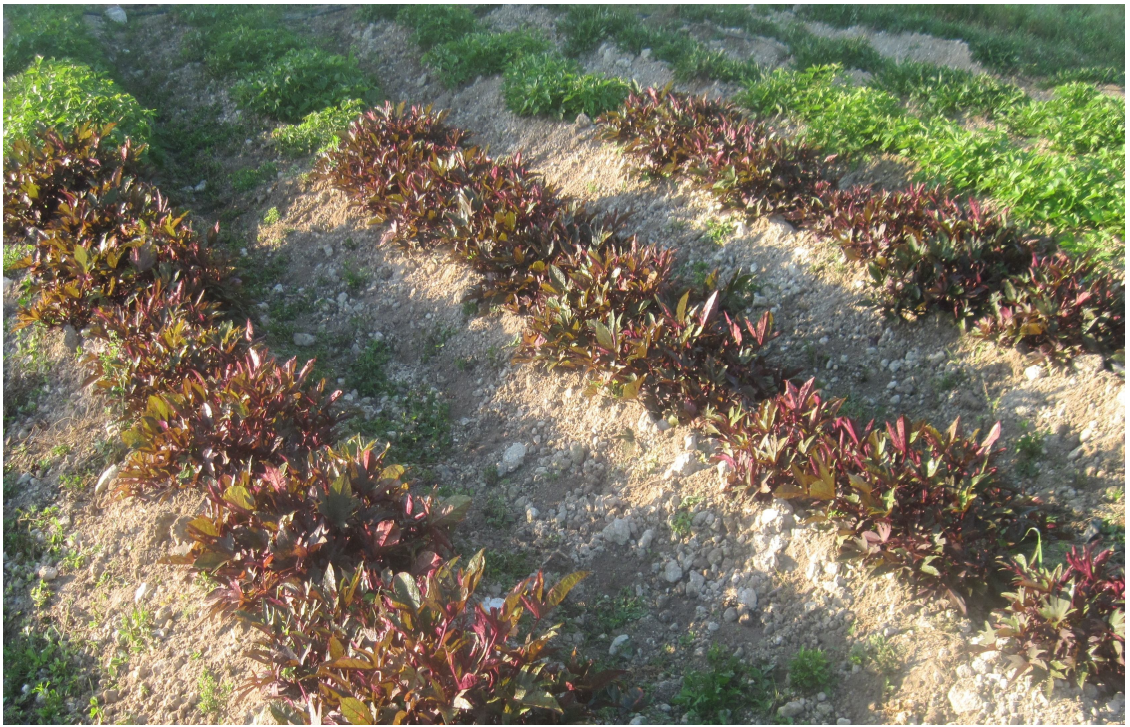
Sweet potato variety trial at the Gladstone Road Agricultural Centre, 2012

This study was conducted as part of the ongoing programme at the Gladstone Road Agricultural Centre to select improved varieties of sweet potato for introduction into the cropping systems of local farmers. Six sweet potato varieties were evaluated from October 2011 to March 2012 for tuber quality and yield. They were also evaluated for their morphological characteristics. The results showed a large variation in the leaf and tuber characteristics for the sweet potato varieties under study. The variety 'Six Weeks', which is an early maturing sweet potato with white flesh and high dry matter content, produced the highest marketable yield at 25.5 t/ha, followed by 'Antigua' which yielded 25.2 t/ha of marketable tubers. Proximate analyses of the raw pulp taken from the tubers of the six sweet potato varieties revealed differences in the mineral contents. The mean values of sodium, on a dry weight basis, ranged from a low 131 mg/100g for 'Three Month' to a high of 389 mg/100g for 'Solomon'. The values for potassium ranged from 381 mg/100g for 'Solomon' to 1106 mg/100g for 'CI001'. The ash content varied from a low 0.82% for 'Six Weeks' to a high 1.45% content for 'Solomon'. From the present study, it is determined that the sweet potato varieties 'Six Weeks' and 'Antigua' should continue to be utilised within the cropping systems of Bahamian farmers, based on their yield potential, tuber quality, disease tolerance, resistance to weevil attack and early maturity.