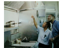
Health Officer conducting inspection