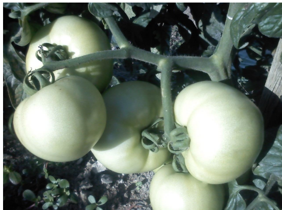
Staked 'Soraya' variety ready for harvest at the Gladstone Road Agricultural Centre during 2012.

The tomato plays an important role in human nutrition by providing essential amino acids, vitamins and minerals (Sainju et al. , 2003). Its vitamin C content is particularly high (Kanyomeka and Shivute, 2005). It also contains lycopene, a very potent antioxidant that may be an important contributor to the prevention of cancers (Agarwal and Rao, 2000).