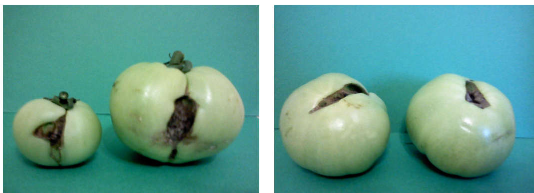
Plate 1. Two views of catfacing on the tomato variety 'Soraya'.

Plates 1 and 2 give some indications of the problems encountered in the field with the cultivation of the tomato crop. The experimental plots were relatively free of problems, with the exception of the catfacing disorder, prevalent only in the tomato variety 'Soraya', and the tomato yellow leaf curl virus (TYLCV), which affected all four varieties.