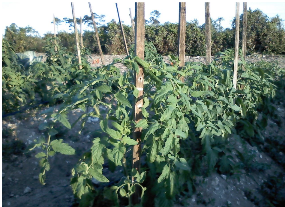
Field plot of staked tomatoes under cultivation at the Gladstone Road Agricultural Centre during 2012.

Challenges faced by Bahamian farmers in their attempts to produce high yielding tomatoes in quantities to satisfy the local market include, poor agronomic practices, adverse climatic conditions, pests and diseases, and varieties unsuited to the growing conditions. This trial was initiated to determine the effects of pruning on the performance of four improved varieties of staked fresh-market tomato plants.