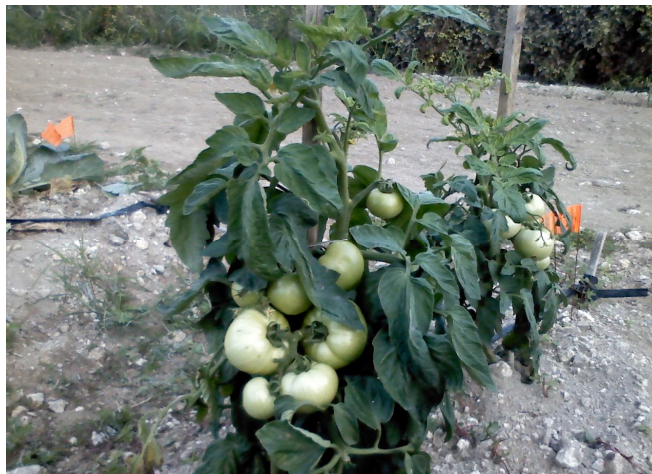
Staked tomato plants growing at the Gladstone Road Agricultural Centre during 2012.

A field experiment was conducted at the Gladstone Road Agricultural Centre from November 2011 to February 2012. This study examined the effects of pruning on yield and quality of four staked tomato varieties: 'BHN543', 'Finishline', 'Rocky Top' and 'Soraya'. The trial was set out in a completely randomised design with three replications. Results showed an increase in tomato yield per plant with pruning. Also with pruning, the number of fruit per plant increased with the varieties 'Rocky Top' and 'Soraya', but decreased with 'BHN543' and 'Finishline'. The potential yield of marketable fruit per hectare was higher in pruned 'Soraya' (10.5 tonnes/ha), followed by 'Rocky Top' (7.8 tonnes/ha), 'Finishline' (6.9 tonnes/ha), and 'BHN543' (5.8 tonnes/ha).