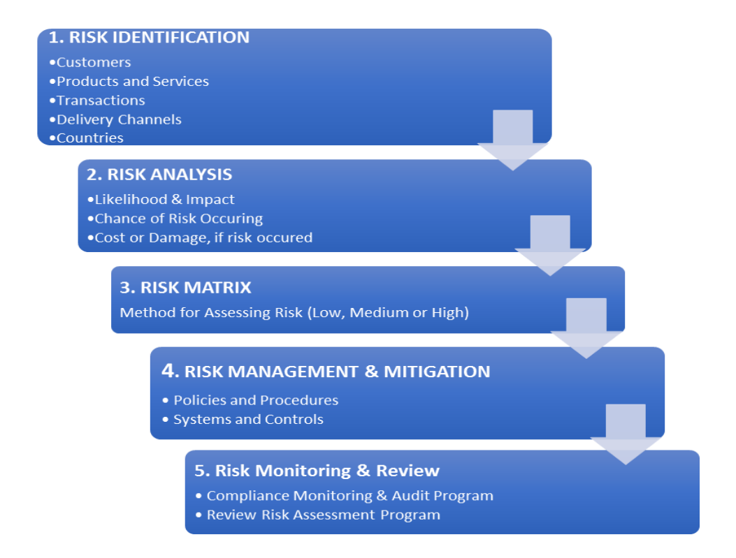
Fig. 4 - OVERVIEW OF FIVE (5) STAGES OF A ML/TF RISK ASSESSMENT PROCESS<sup>11</sup>: