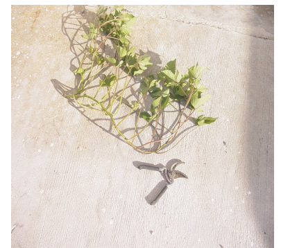
Plate 2. Unrooted vine cutting

The 2 x 2 factorial experiment was laid out in a completely randomised design, using the two sweet potato varieties in two different treatments, replicated three times. The plants were established on ridges 1.5 m apart, with 0.6 m spacing between plants within the rows. Each plot consisted of 10 plants.