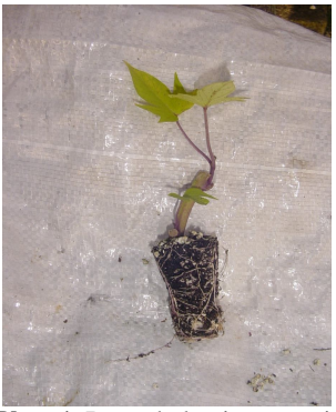
Plate 1. Rooted planting material

The study was carried out at the Gladstone Road Agricultural Centre, New Providence, from April to October 2010. Two different types of planting material were examined in this experiment: rooted cuttings (Plate 1) and freshly cut unrooted vines (Plate 2). Two node cuttings of sweet potato were rooted in polystyrene trays containing a potting mixture (Pro-Mix<sup>®</sup>). The plantlets were propagated under shade and were kept well watered until they produced a well-developed root system and at least two fully expanded leaves. After two weeks of growth, the plants were transplanted directly to field plots. At the same time, fresh vine cuttings of approximately two feet in length were cut from stock plant material in the field and planted directly to the experimental plots. The two white fleshed sweet potato varieties used in this evaluation were 'Antigua' and 'Six Weeks'.