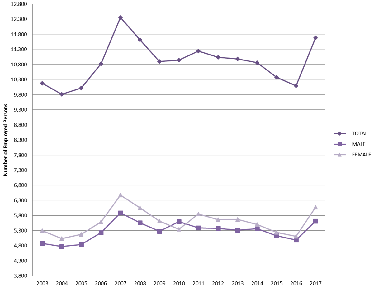
Number of Employed Persons in the Accommodation and Food Service Activities Industry by Gender 2003-2017