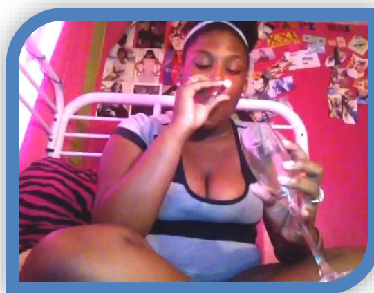
Photo of youth smoking an e- cigarette