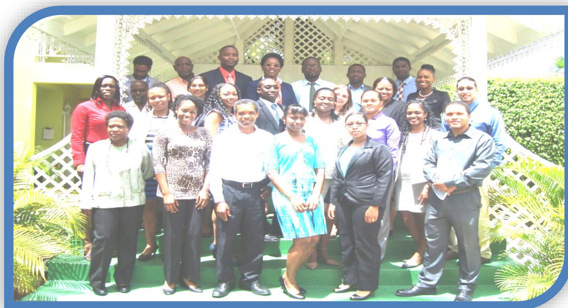
Representatives from the ten member states took time out for a group photo.

The specific objectives of the workshop was to discuss drug and alcohol treatment in participating countries, present data on 2014 drug treatment in the Caribbean, to undertake a detailed review of the standardized instrument, to present the experiences of countries involved in data collection, to introduce a new data entry template and new software to participants (Epi. info and excel), and to discuss and agree on a way forward.