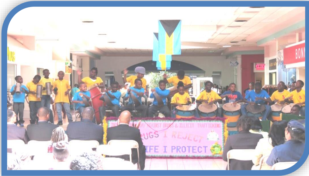
The dynamic students of Gerald Cash Primary School performing at the Opening of the Exhibition.