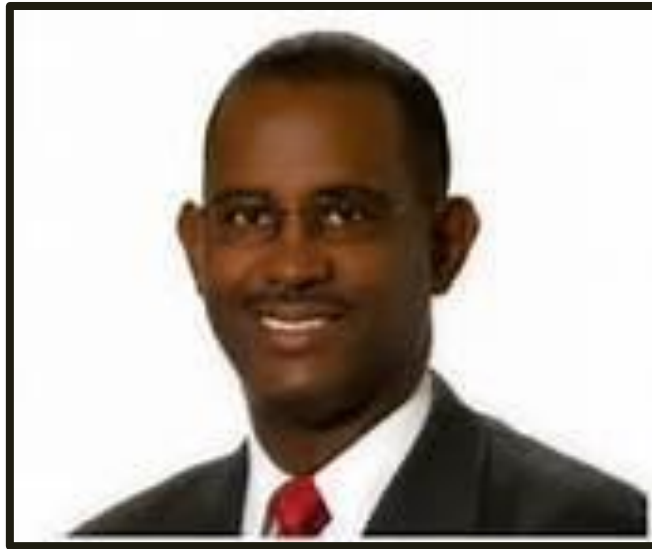
Hon. Orville Alton Turnquest