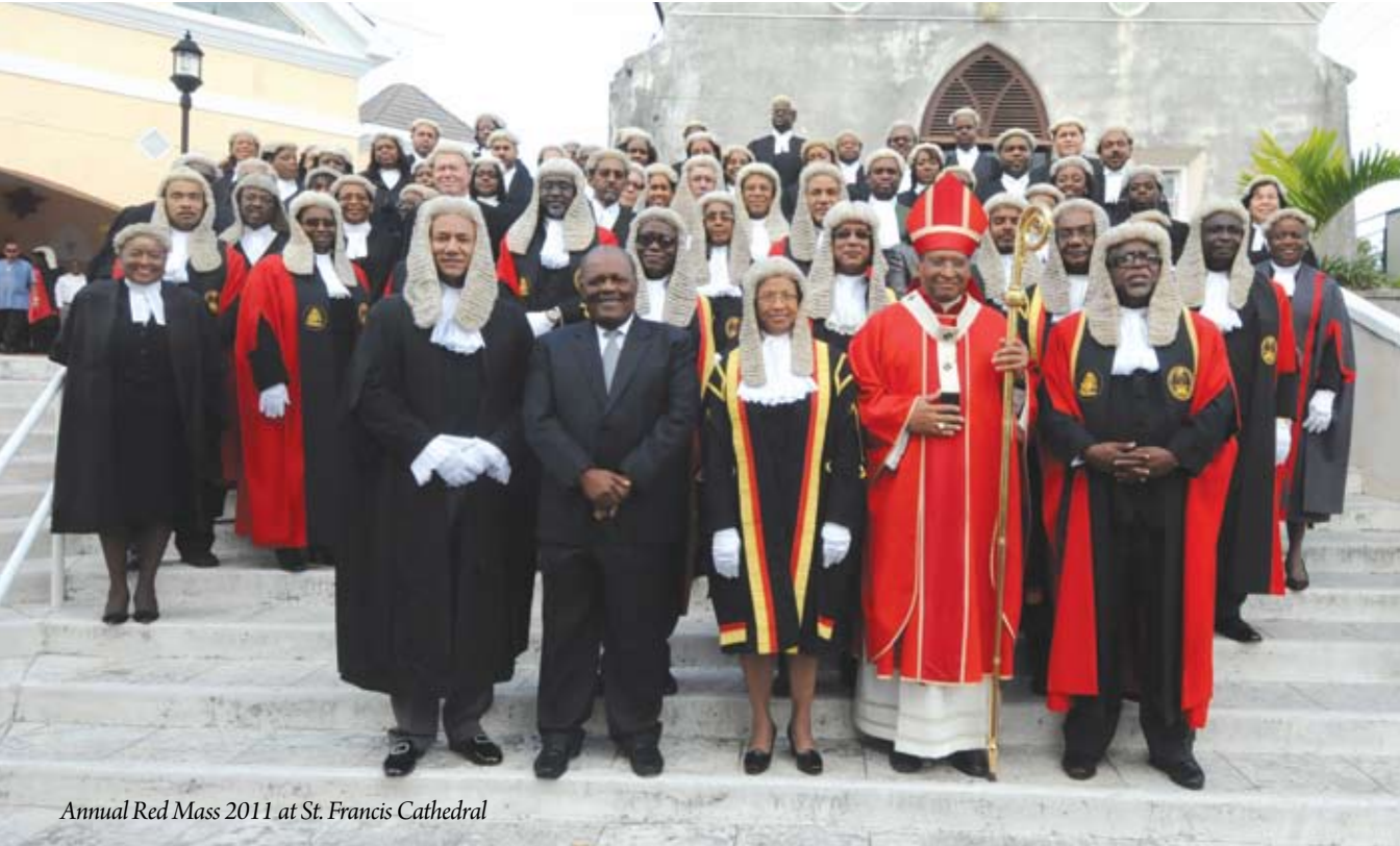
Annual Red Mass 2011 at St. Francis Cathedral