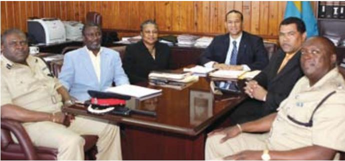
AG and DPP in discussion with Commissioner of Police and senior officers.

result of improving the quality of case preparation by the police and has made it possible for most serious cases to be expedited from the Magistrates' Court to the Supreme Court by use of the voluntary bill of indictment procedure. This has contributed to more cases entering the Supreme Court during 2011 than prior years 21 .