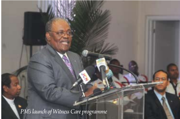
PM's launch of Witness Care programme

ii. The Witness Care Unit (WCU) , designed to provide appropriate support service to victims and witnesses (witnesses being critical components of the justice system and essential to the prosecution case), with appropriate programming, was officially launched by the Prime Minister in February 2011 in relation to matters pending trial in the Supreme Court. WCUs have now been constituted in New Providence, Freeport, and Eleuthera. WCU personnel have kept witnesses informed of trial fixtures or other developments in their cases. Where needed, they have accompanied witnesses to court on trial dates; arranged for vulnerable witnesses to be securely transported to and from court; and generally serve as a meaningful liaison with witnesses in criminal matters pending before the Supreme Court.