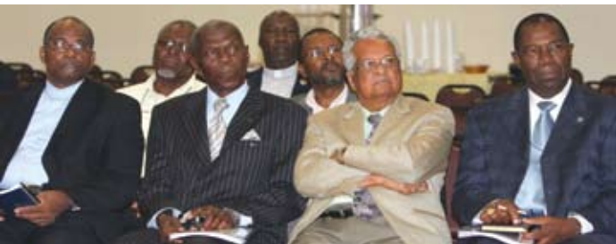
AG discusses Anti Crime Bill with religious leaders in New Providence.