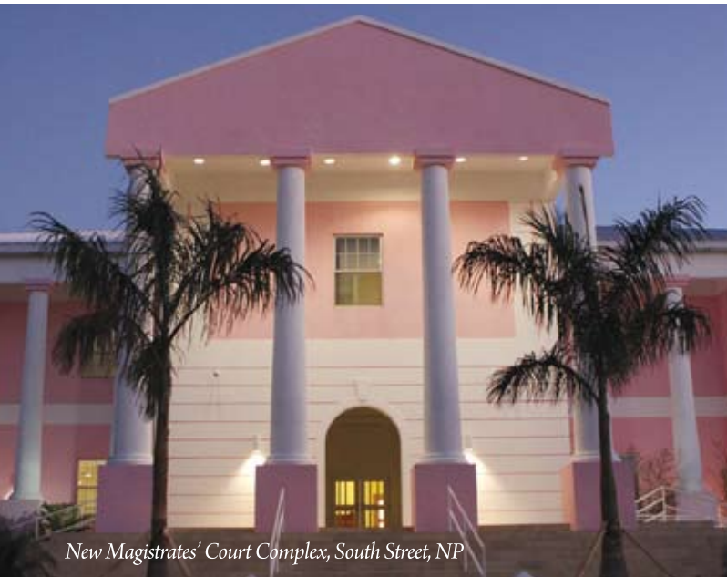
New Magistrates' Court Complex, South Street, NP