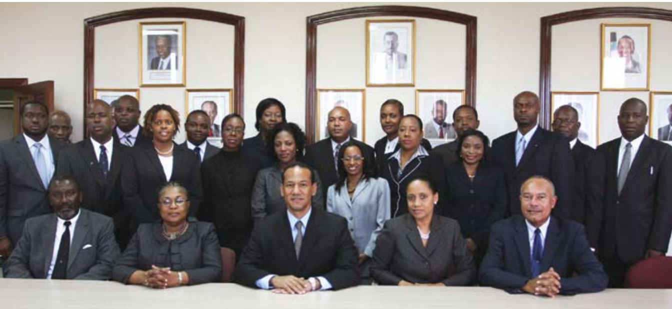
Sixteen new prosecutors joined the ranks of the Department of Public Prosecutions.