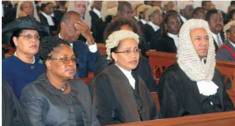
Opening of the 2011 Legal Year at Christ Church Cathedral

Highlights and summary of activities of the Attorney-General and the portfolio agencies during 2011 -