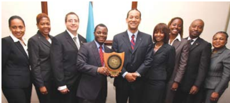
The victorious Eugene Dupuch Law School Mooting Team