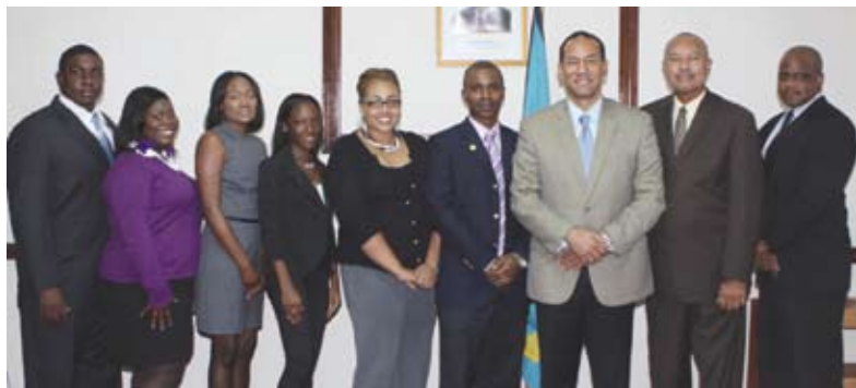
Attorney-General meeting with LLB students at COB.