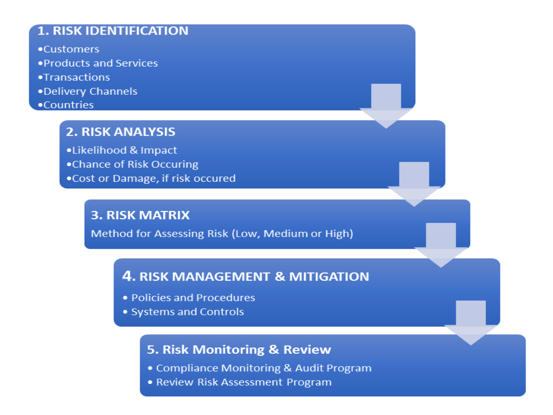
Fig. 4 - OVERVIEW OF FIVE (5) STAGES OF A ML/TF RISK ASSESSMENT ROCESS<sup>12</sup>: