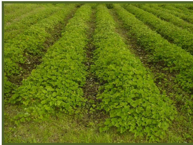
Rows of late-maturing 'Solomon' sweet potato in the field at the Gladstone Road Agricultural Centre

Two late-maturing heirloom sweet potato varieties, 'NP001' and 'Solomon', were evaluated at the Gladstone Road Agricultural Centre to determine the optimum time to harvest, by harvesting at monthly intervals from August 2010 to February 2011. Different harvest times had a significant effect on tuber yield of the two sweet potato varieties. The ideal time to harvest the two late-maturing sweet potato varieties is 9 months after planting to obtain maximum yields without any loss in tuber quality. Delaying harvest until 10 months does not result in a significant increase in yield and after that harvest time there is a significant reduction in tuber quality and yield.