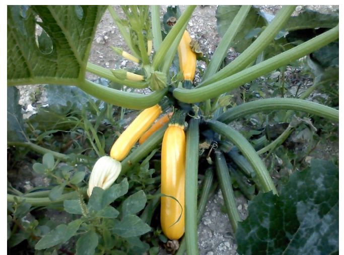
Yellow zucchini (Cucurbita pepo L.) grown at the Gladstone Road Agricultural Centre during 2012

The evaluation of a yellow zucchini (Cucurbita pepo L.) variety was conducted in a replicated small plot trial at the Gladstone Road Agricultural Centre during 2012, to examine yield and quality of the zucchini variety 'Sebring' over several harvests and under local field conditions. The first harvest occurred on the 3 February, 51 days after planting, followed by harvests on the 10, 17 and 24 of February. Weights of the zucchini variety 'Sebring' were within the range of similar zucchini types. Because of the short growing time, this crop can be grown at several different planting dates during the cool growing season. For added value, yellow zucchini slices can be added to a mixed vegetable package and sold as a frozen food item by local farmers.