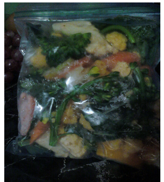
Plate 2. Yellow zucchini slices included in a mix of frozen vegetables grown at the Gladstone Road Agricultural Centre during 2012

Zucchini is used generally as a cooked food item, but is sometimes eaten raw as a fresh salad ingredient. The fruit is usually harvested when it is 20 cm (8 in) or less in length while seeds are still soft and palatable. It can be prepared in many ways, including boiled, baked, steamed, stir fried or grilled. Sliced zucchini can last for a long time, if frozen and stored properly. For added value, yellow zucchini slices can be added to a mixed vegetable package (Plate 2) and sold as a frozen food item by local farmers.