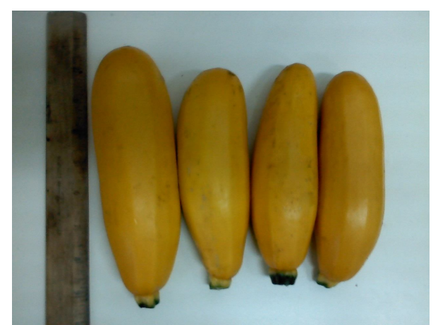
Plate 1. Fruits of the variety 'Sebring' harvested at the Gladstone Road Agricultural Centre during 2012