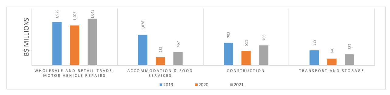
Graph 2: Industries Experiencing the Greatest Recovery in 2021