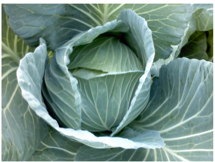
Cabbage variety 'Benelli' grown at the Gladstone Road Agricultural Centre during 2012.

Three cabbage varieties, 'Benelli', 'Cairo' and 'Paradox', were evaluated in a replicated small plot trial at the Gladstone Road Agricultural Centre during 2012. The factorial experiment was established in a completely randomised design, using three cabbage varieties harvested at four different dates. Significant differences for head width and head length were obtained among the varieties tested, with significant interaction between harvest date and variety. There was no significant effect for cabbage weight. The results obtained showed that the variety 'Paradox' produced the longest head length and largest head width. In addition, the highest head weight and best yield potential (37.7 tonnes/hectare) were obtained from this same variety.