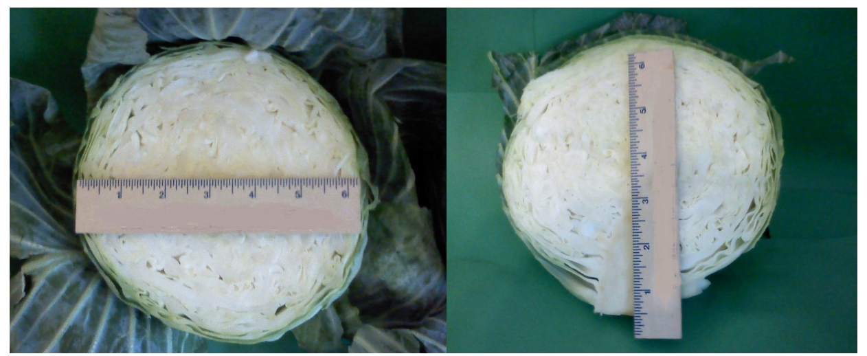
Plate 1. Mature compact heads of cabbage cut to show how measurements were calculated; width (left) in horizontal section and length in vertical section (right).

The variety 'Paradox' produced the longest head length and largest head width. Plate 1 illustrates the method used to determine the head width and head length of the three cabbage varieties.