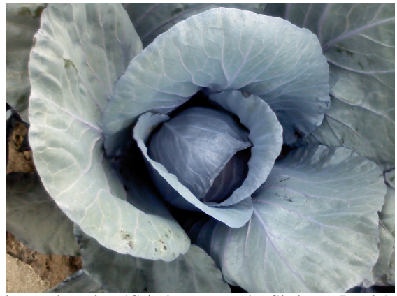
Developing cabbage head of the purple variety 'Cairo', grown at the Gladstone Road Agricultural Centre during 2012

Cabbage is a significant crop in The Bahamas, is widely grown, and is a good source of income for local farmers. Production of this crop is almost year round, produced mainly by small and medium-sized farmers. Cabbage is produced on approximately 75 hectares (185 acres) of farmland, constituting some 4.0% of the total area under vegetable production (Ministry of Agriculture, 1996). Local yields have been estimated at about 12.6 tonnes per hectare (10,282 lb per acre) (Ministry of Agriculture, 1996). Cabbage is a hardy vegetable crop that does well under growing conditions of The Bahamas, if suitable varieties are selected. Among the major considerations in selecting improved varieties suitable for cultivation on Bahamian soils are head shape and size.