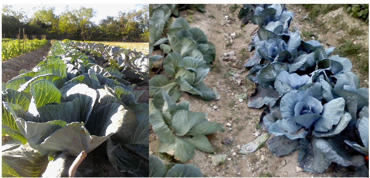
Two views of the cabbage variety trial established at the Gladstone Road Agricultural Centre during 2012