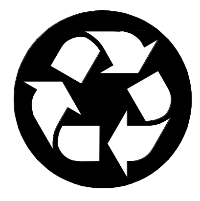
Figure 1 — Examples of the Mobius loop