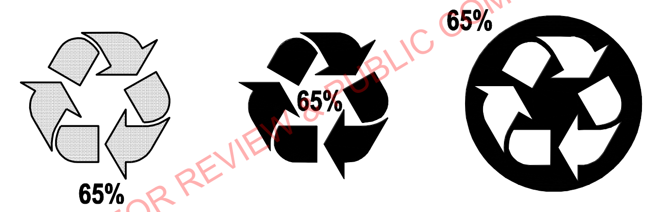
Figure 2 — Examples of acceptable locations of percentage value when using the Mobius loop to make claims about recycled content