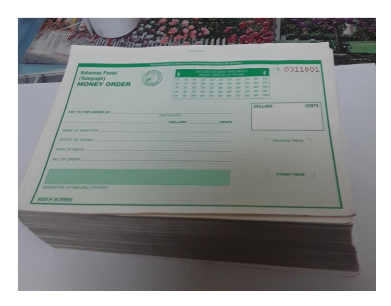
Unused Telegraph Money Order Sold

3.3 It is recommended that the General Post Office be notified and a decision be made as to the Telegraph Money Orders.