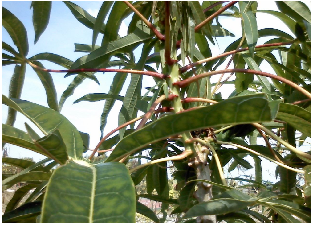
Cassava (Manihot esculenta Crantz)