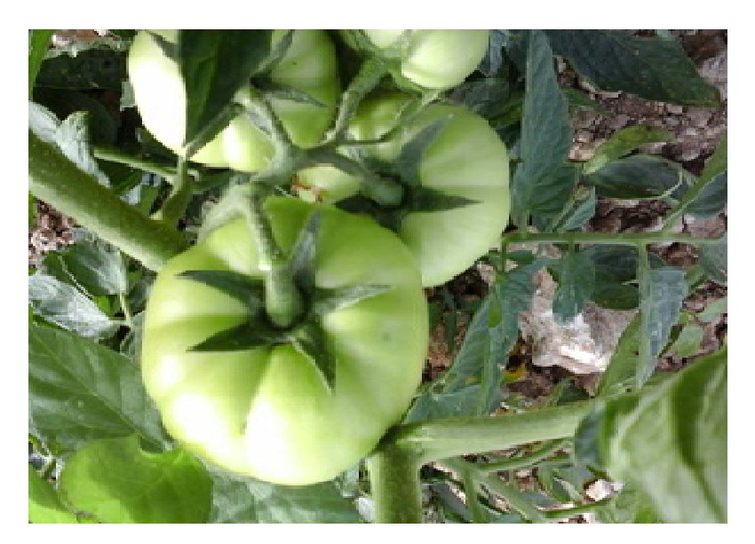
Tomato variety HA3080 grown at the Gladstone Road Agricultural Centre during 2016

A field trial was conducted at the Gladstone Road Agricultural Centre from March to June 2016. This study evaluated four tomato varieties for heat tolerance in a factorial experimental design with four replications over each of eight harvest dates. The four varieties were 'Big Yellow', 'Christy', 'HA3080' and 'Inbar'. Significant differences were observed between the four varieties for the total number of fruit per plant, the total weight of fruit per plant, the weight of a single fruit, the weight of marketable fruit per plant and the number of marketable fruit per plant. The variety 'Big Yellow' produced no fruit, while variety 'Christy' produced only a small quantity of marketable fruit. The variety producing the largest number of fruit per plant was 'Inbar' followed by 'HA3080'. The potential yields for the tomato varieties ranged from 1.7 tonnes/hectare for 'Christy' to 6.3 tonnes/hectare for 'Inbar'.