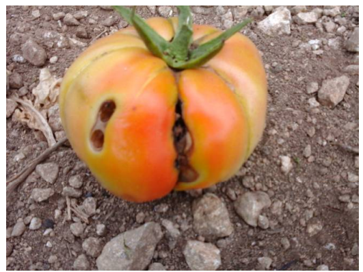
Plate 1. Catfacing on ripening fruit of 'Christy' tomato

According to Barten et al. (1992), catfacing occurs when tomato plants are exposed to low temperatures during flowering and can result in a severe reduction in yields. Catfacing was not as severe as in previous tomato trial (Richardson, 2013a), most likely due to the warmer conditions during flowering and fruiting.